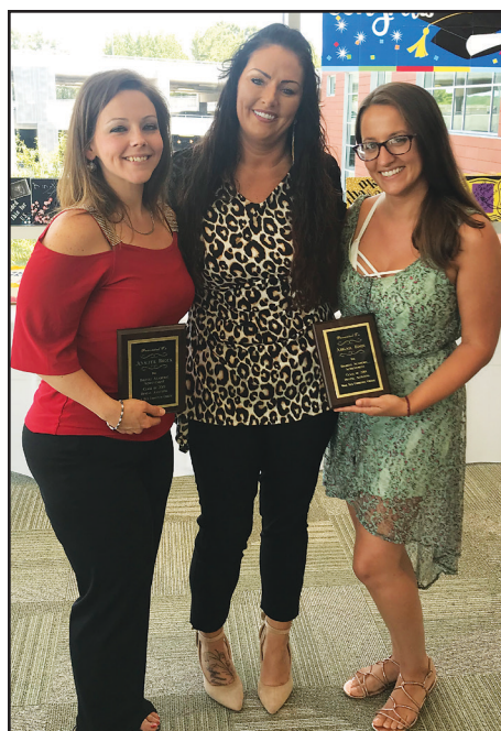
Wake Tech DA program graduation and awards luncheon.