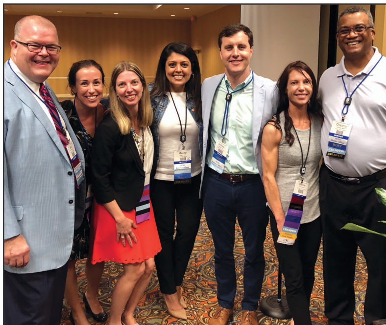
NCDS 4th district officers and delegates