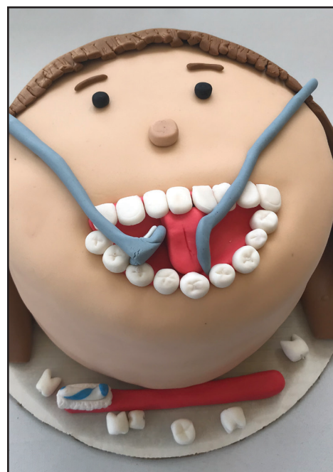
Best dental cake