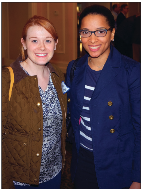
Doctors enjoying RWCD monthly meetings