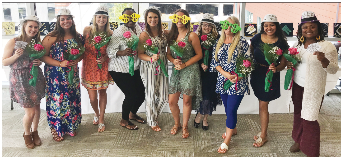
Wake Tech DA faculty