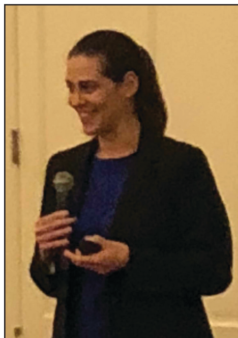
Board members enjoying an eventful meeting