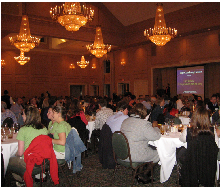
The meeting had over 240 members and staff members present. The presentation was from the Coaching Center, "I love dentistry – It's the people who make me crazy!"