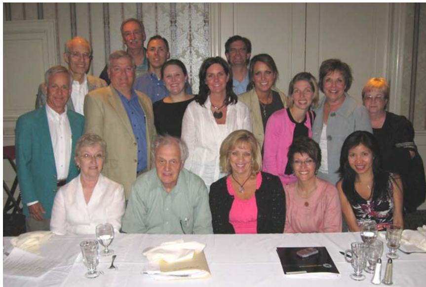
RWCDS Executive Board and WTCC Dental Hygiene Advisory Committee